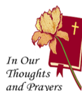
In Our Thoughts and Prayers